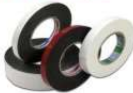
PE-PU Foam Tapes