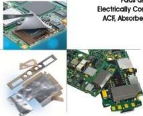
3M Materials – Thermally Conductive Tapes, Pads and Grease and Electrically Conductive Tapes, ACF, Absorbers and Gaskets