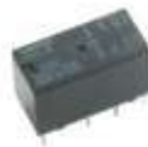
Miniature Relay For Signal Circuits