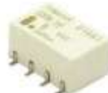
Sub-miniature Surface Mounting Relay