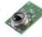
[Human Body Sensors to Save Energy] Heat source detection MEMS Thermal Sensors D6T