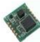
Detecting At Seismic Intensity Level 5 Or Higher Earthquake Sensor D7S