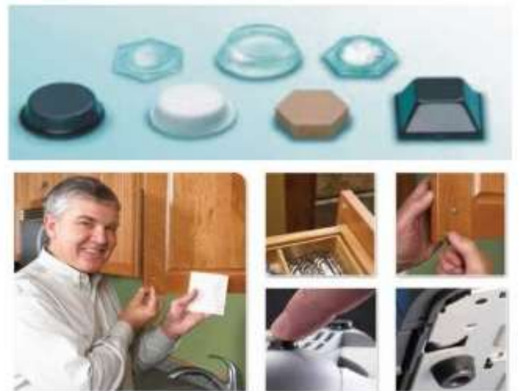
3M Bumpons Protective Products