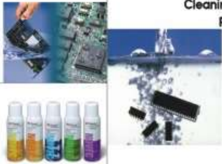
3M Engineered Fluids for Cleaning, Coating and Reliability testing