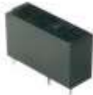
Compact single pole 3A (5A) high isolation Relay